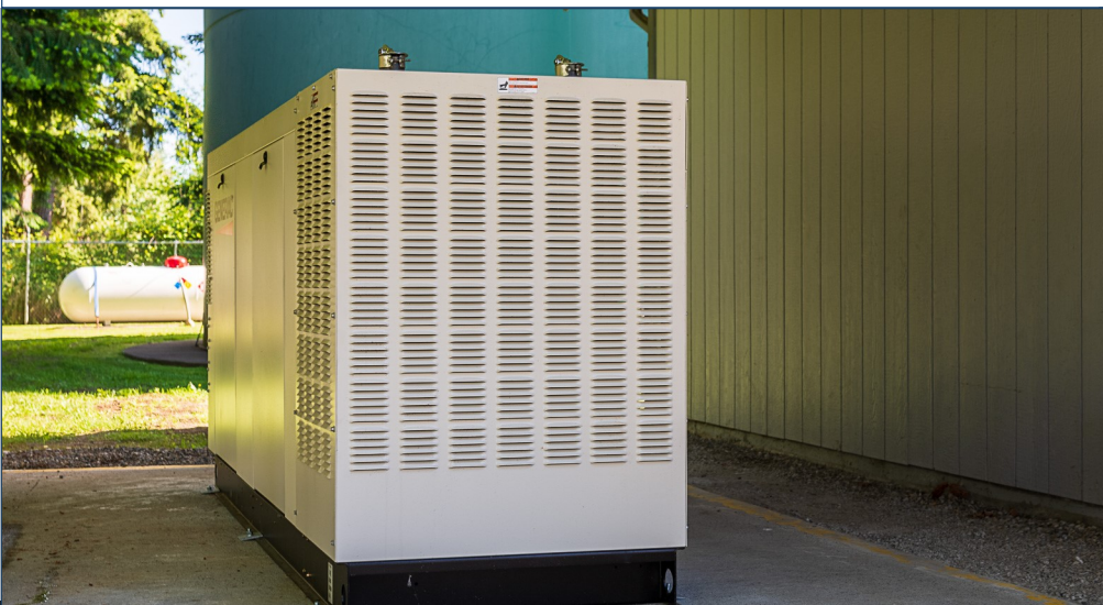
Emergency Generator and Propane Fuel Tank at Well House #3.

The Washington State Department of Health (WADOH) carried out Sanitary Surveys of our water system in June 2004, January 2009, December 2012 and March 2015. We used the assessments to guide us in our updates of our Comprehensive Water Plan (2006 and 2012). In 2015, the WADOH said: "In general, your water system is in very good sanitary condition and you should be commended for your efforts and diligence on the water system. Your work helps to protect the health of the community." Copies of the Sanitary Surveys, including the December 16, 2008 "Special Purpose Investigation", are available for review in the office.