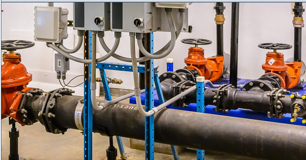
Pumps and valves in Well House #3.

The Washington State Department of Health (WADOH) carried out Sanitary Surveys of our water system in June 2004, January 2009, December 2012 and March 2015. We used the assessments to guide us in our updates of our Comprehensive Water Plan (2006 and 2012). In 2015, the WADOH said: "In general, your water system is in very good sanitary condition and you should be commended for your efforts and diligence on the water system. Your work helps to protect the health of the community." Copies of the Sanitary Surveys, including the December 16, 2008 "Special Purpose Investigation", are available for review in the office.